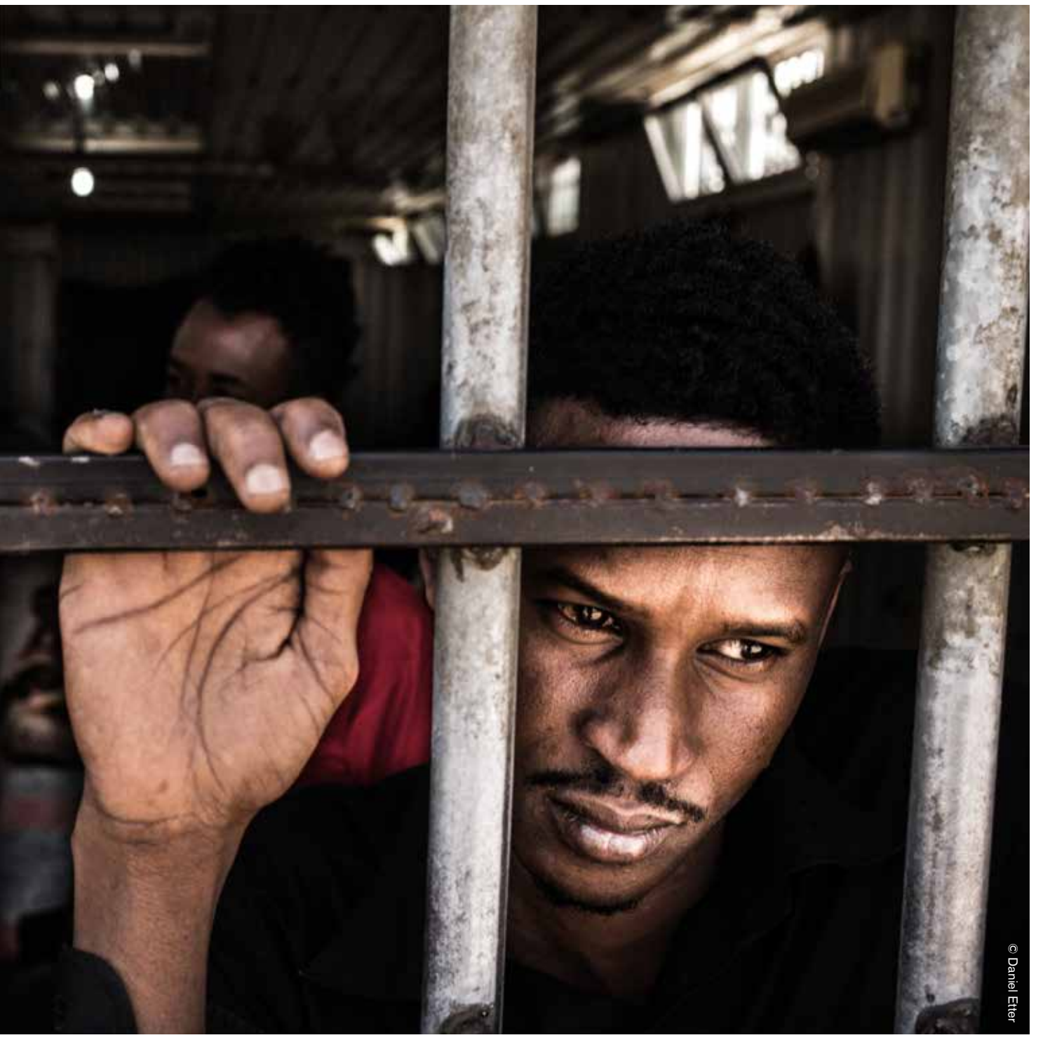
Dying to reach Europe: Eritreans in search of safety 9