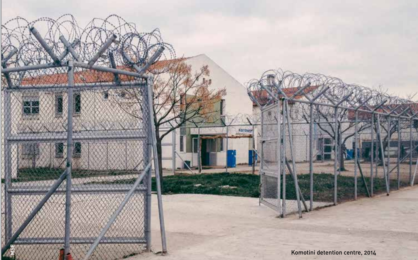
Komotini detention centre, 2014