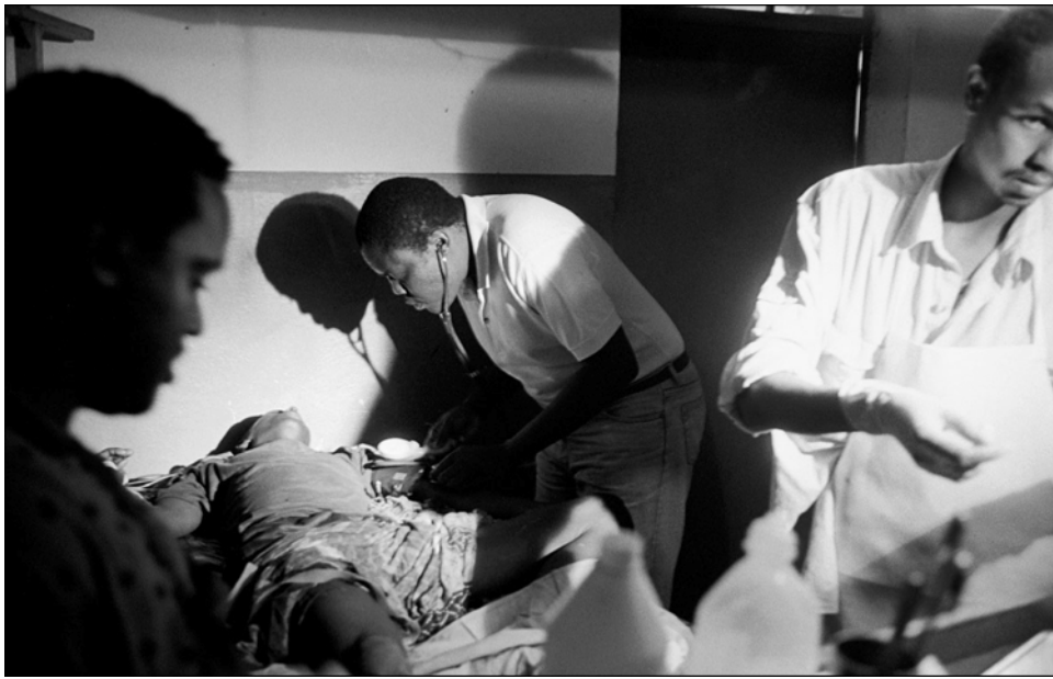
Surgery at MSF's health centre in Dinsor