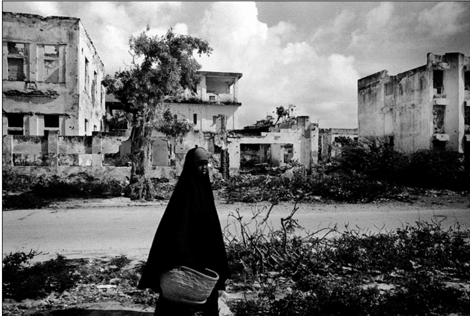
In the streets of Mogadishu the signs of conflict are striking.

"Mogadishu was a beautiful, quiet town before the war. Now everything is different." - MSF pharmacist Anab Mohamud Mohamed