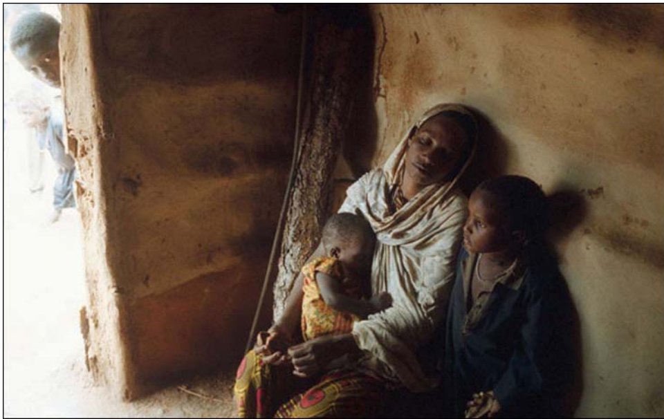
This Bantu woman in Marere has lost three children to malnutrition.