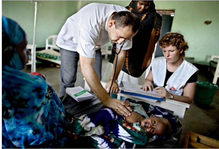
Doctor doing his round in the paediatric ward of Istarlin Hospital.