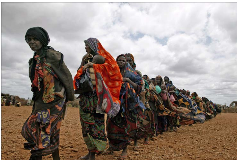
800 women and children line up for a monthly nutritional screening in Istorte, Bakool region.