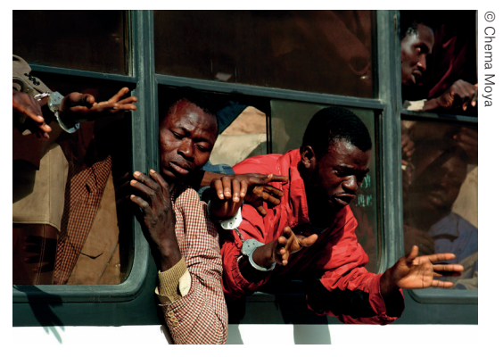
Handcuffed migrants being transported to a detention centre in Morocco, 2005

All of this is accompanied by numerous restrictive immigration policies and practices, including: restrictive interpretations of and overt disrespect for refugee law; obstacles to accessing asylum procedures; limited access to basic services including healthcare; and the increased and prolonged use of detention.<sup>8</sup>