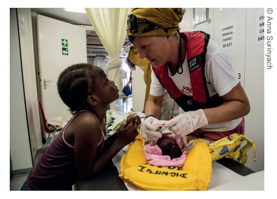
A medical consultation on board the MSF search and rescue ship Dignity I, 2015

described as overcrowded, with daily beatings, a lack of sufficient food, water and sanitation, and a complete lack of medical assistance.