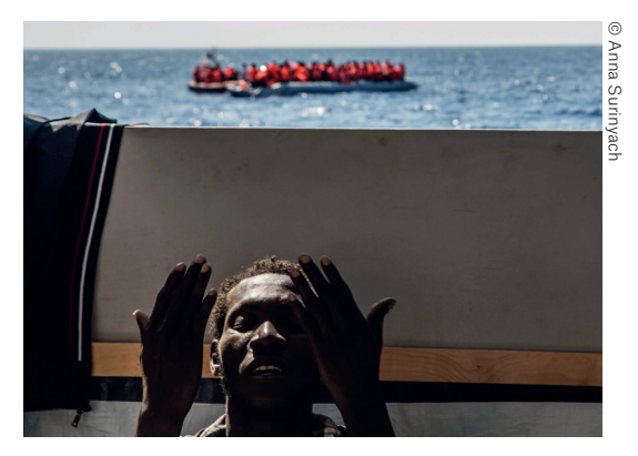
A man rescued by the MSF search and rescue ship Dignity I prays on the deck, behind him another rescue is being carried out, 2015

"In Sabah bandits came out of the car and pulled me out of the taxi and took me to a corner and raped me. They took everything from me, then they left me there on the street. I was covered in blood. Even now I have nightmares." — 25-year-old woman on board MSF search and rescue ship Dignity I, 2015.