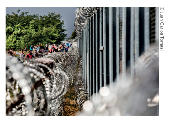
Refugees at the Hungary-Serbia border fence, 2015

Migration Commissioner Dimitris Avramopoulos, March 2015.<sup>1</sup>