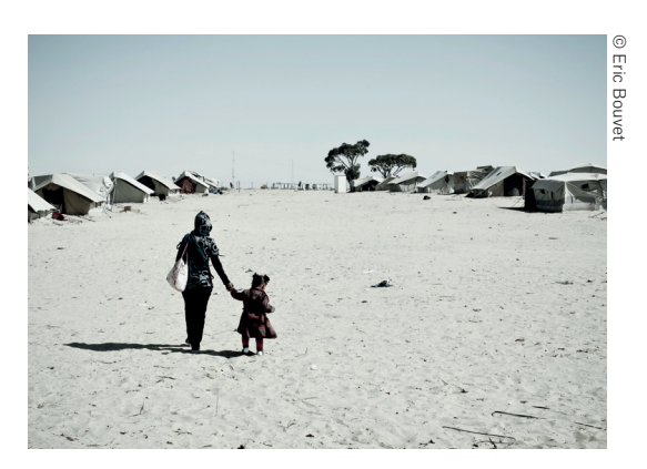
A woman and child walk in Shousha camp, Tunisia, 2011

"In this prison we were beaten every single day, they were very, very brutal... People were sick but there was no hospital, no doctor to care for them. Some died in this prison. I saw two Nigerians dying because they had been too severely beaten... A lot of women were there too, they were all deported." - 29-year-old man Sidi Bilal, Libya, 2011.