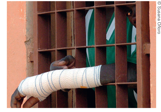
A migrant held in a Moroccan detention centre, 2005

At Valletta and beyond, MSF urges EU member states and their African partners to remember that people on the move are just that – people. MSF calls on the EU and AU and their respective member states, in full respect of international and national refugee and asylum laws, to develop and implement protection mechanisms which ensure that all people in flight are treated in a humane and dignified manner.