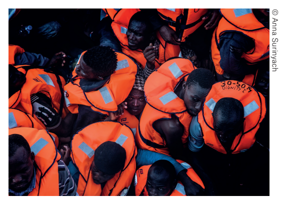
People on board a dinghy rescued by the MSF ship the Dignity I, 2015