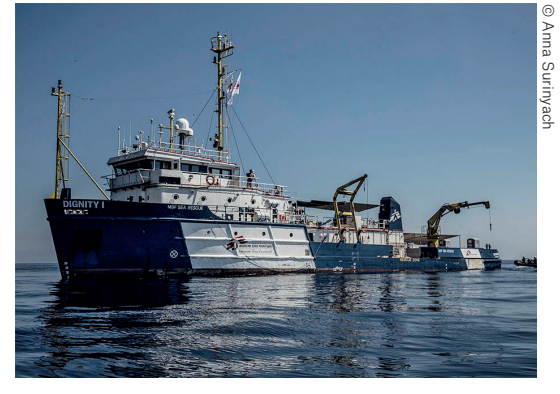
The MSF search and rescue ship Dignity I, 2015

The continued chaos inside Libya, culminating with the collapse of the Libyan central government and the new civil war in 2014, meant that such arrangements were impossible to manage. Italian cooperation effectively collapsed and EUBAM downscaled in October 2014; today it is limited to technical trainings outside Libyan territory.<sup>33</sup>