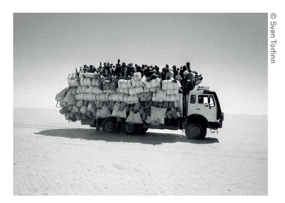
People loaded onto a truck going through the Sahara from Agadez, Niger to the Libyan border, 2002

In April 2015, more than 800 people died off the coast of Libya. The incident made global headlines and did elicit a response from the EU. Albeit under the auspices of Frontex, and therefore primarily as a border control mission, search and rescue capacity did increase in 2015. However, there is still no long-term institutional response from the EU for a dedicated search and rescue programme. In contrast, the EU was rapidly able to agree the EUNAVFOR (later Operation Sophia) mission to target smugglers and traffickers, tackling the symptom and not the cause of the problem.<sup>21</sup> Despite all efforts, so far in 2015 the International Organization for Migration (IOM) estimates that 3,257 people trying to reach Europe have lost their lives in the Mediterranean Sea.<sup>22</sup>