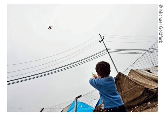
A young Syrian Kurdish refugee in Domeez camp, Iraqi Kurdistan, 2013

Return and readmission agreements are an increasingly central tool in migration policies and a major component of externalised migration management.<sup>14</sup> These sometimes require third countries to take back non-nationals, and there is an increased focus on flexible arrangements which are faster but also more opaque. While in principle return and readmission agreements should not affect asylum procedures, in practice there have been numerous abuses associated with them, including serious concerns about how asylum requests are processed; returns of people without establishing their asylum status; refusal to admit people at borders without determining their protection needs; and returns of people to countries where their protection is not guaranteed.<sup>15</sup>