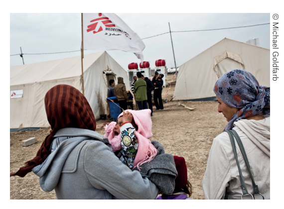
Syrian refugees in Domeez camp, Iraqi Kurdistan, 2013

While a humanitarian response is urgently needed to address the refugee crisis, it is important not to instrumentalise humanitarian action for other purposes.