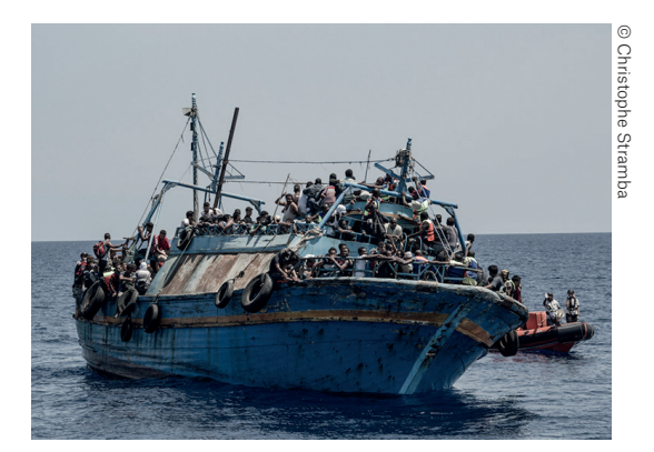
A wooden boat of 613 people rescued by the MSF ship the Bourbon Argos, 2015

Since the year 2000, more than 30,000 people are estimated to have died attempting to reach Europe, the vast majority in the Mediterranean Sea.<sup>18</sup> Yet in November 2014, the EU voted to cancel the Mare Nostrum search and rescue programme set up in response to the 2013 Lampedusa tragedies. Concerned that people would die unnecessarily as a result of the cancellation of Mare Nostrum,<sup>19</sup> MSF launched three search and rescue operations,<sup>20</sup> one in collaboration with the Migrant Offshore Aid Station (MOAS), the first of which started in May. So far, the MSF and MSF-MOAS collaboration efforts have rescued more than 17,000 people.