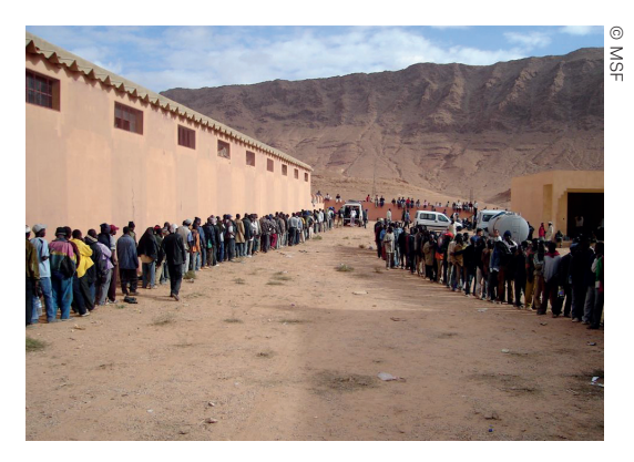
Hundreds of migrants abandoned in the desert by the Moroccan authorities, 2005

women, minors and seriously ill people with chronic diseases such as TB and HIV/AIDS taken to the border and abandoned. In 2012, MSF recorded 191 incidents of expulsion, with more than 6,000 people expelled.