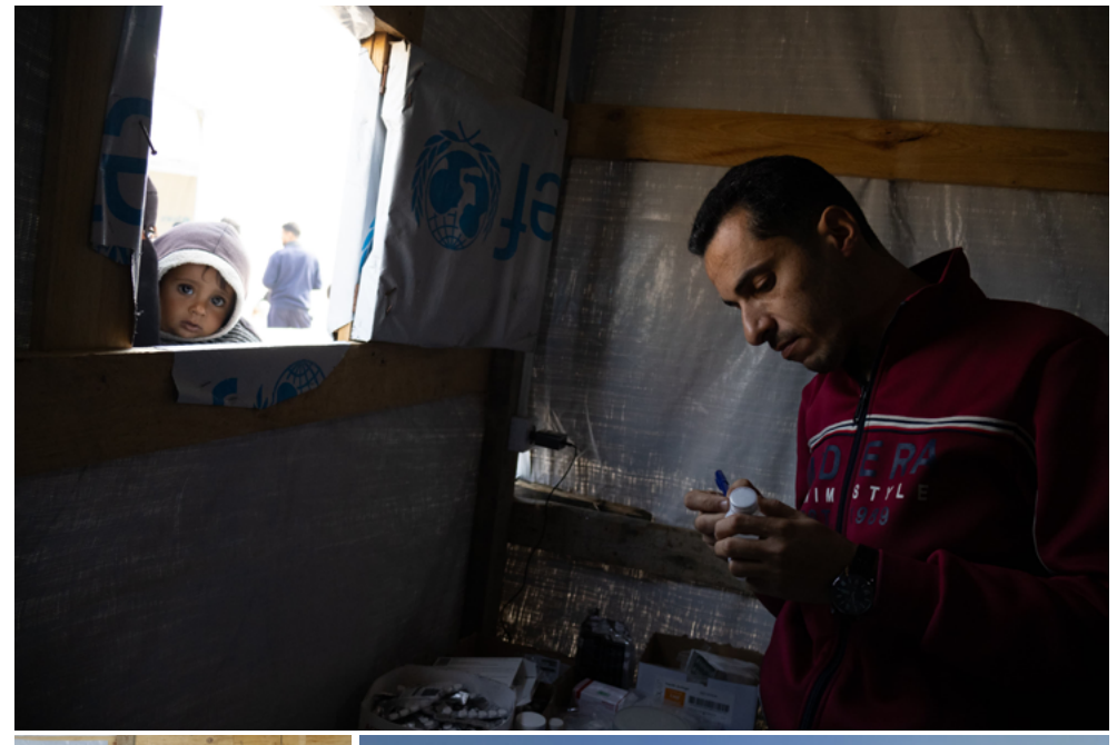
Photos: Left. MSF staff member in Al-Mawasi temporary primary healthcare centre. Right. MSF's Al-Mawasi temporary primary healthcare centre in Rafah opened in January 2024