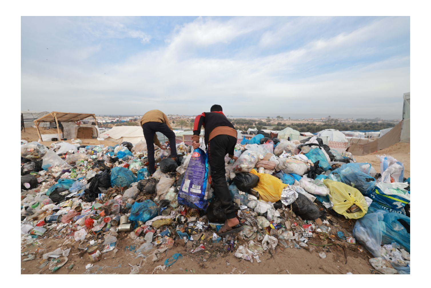
Photo: People in Rafah search through rubbish for food or other salvageable items