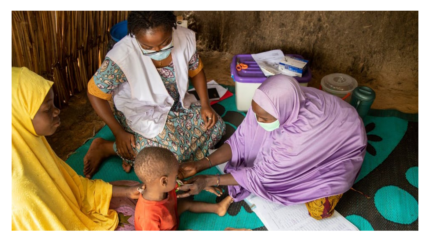
In Niger, changing rain patterns are impacting food production and the spread of infectious diseases. In Magaria, in southern Niger, MSF is supporting a community-based health project to respond to high rates of malnutrition and malaria in remote areas. Mario Fawaz/MSF, August 2021.

"It is very alarming what the communities are saying, because here we live off agriculture and livestock farming, and these two sectors don't meet the needs of the people. The rains are becoming scarce and unevenly distributed... now they are concentrated in one month." Salissou Abdel Aziz, MSF Health Promotion Supervisor in Niger