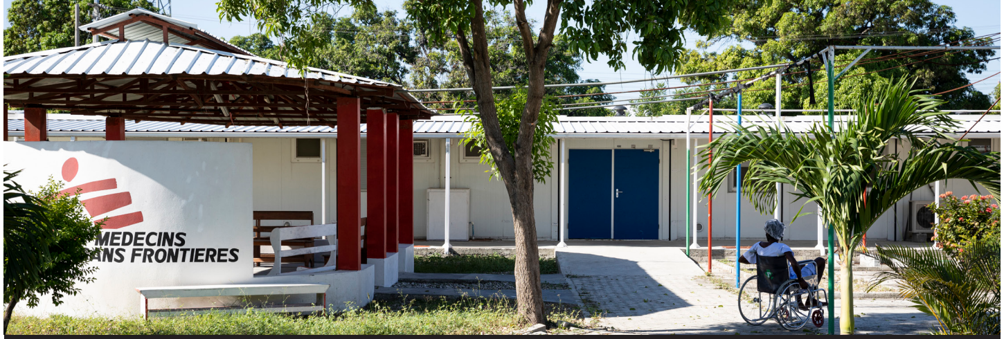
A view of MSF's emergency trauma hospital in Tabarre, Port-au-Prince.

In addition to the five structures we run or support, MSF has also reinforced its assistance to the Ministry of Health emergency department at Port-au-Prince main hospital by organizing donations of medical equipment and material, rehabilitating facilities, and training staff. In order to improve maternal and neonatal care, we will soon support a referral hospital in the South Department.