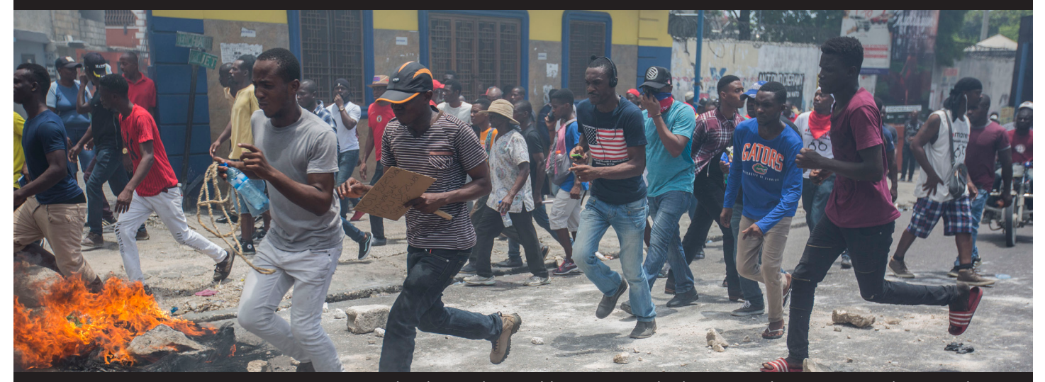
Protesters\ run\ near\ burning\ tires\ during\ a\ political\ demonstration\ in\ Port-au-Prince.\

Since July 2018, Haiti has been engulfed in a deepening political and economic crisis. While thousands of demonstrators have taken to the streets to protest skyrocketing prices of goods, a lack of economic opportunities, and government misuse of funds, the international community has mostly remained silent.