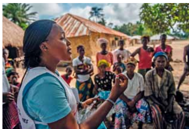
A health promoter talks to village residents about health issues during a MSF outreach mission, Sierra Leone

In August 2014, the Liberian government quarantined an entire neighbourhood of the capital Monrovia using military personnel in an attempt to prevent further spread of the virus. This was not well received by the community: