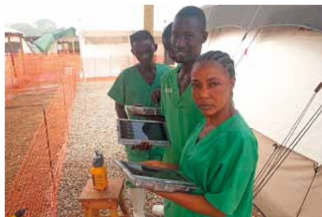
Staff testing one of the Clinical Management Tablets at the Magburaka ETC