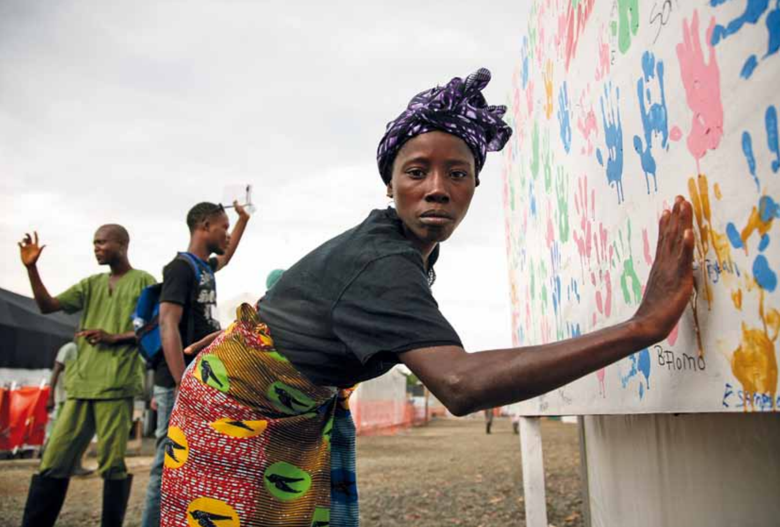
An Ebola survivor 'signs' the wall at ELWA 3, Monrovia