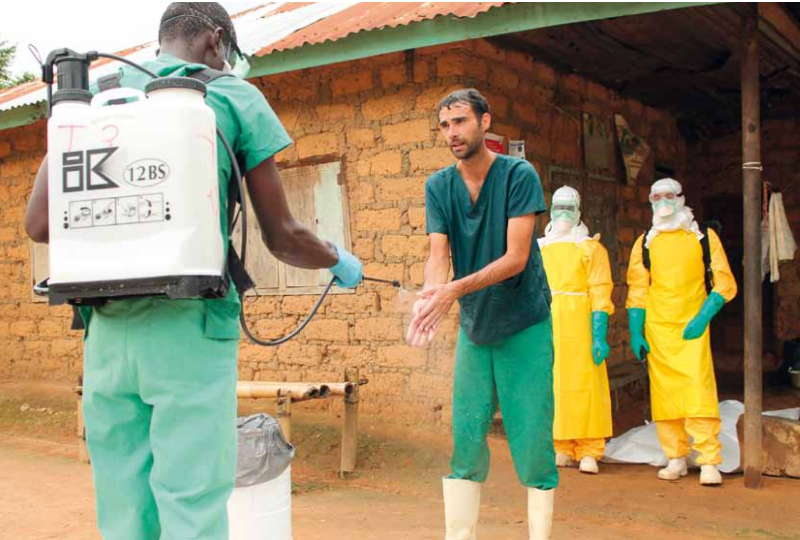
During the disinfection procedure at an outreach activity, Foya