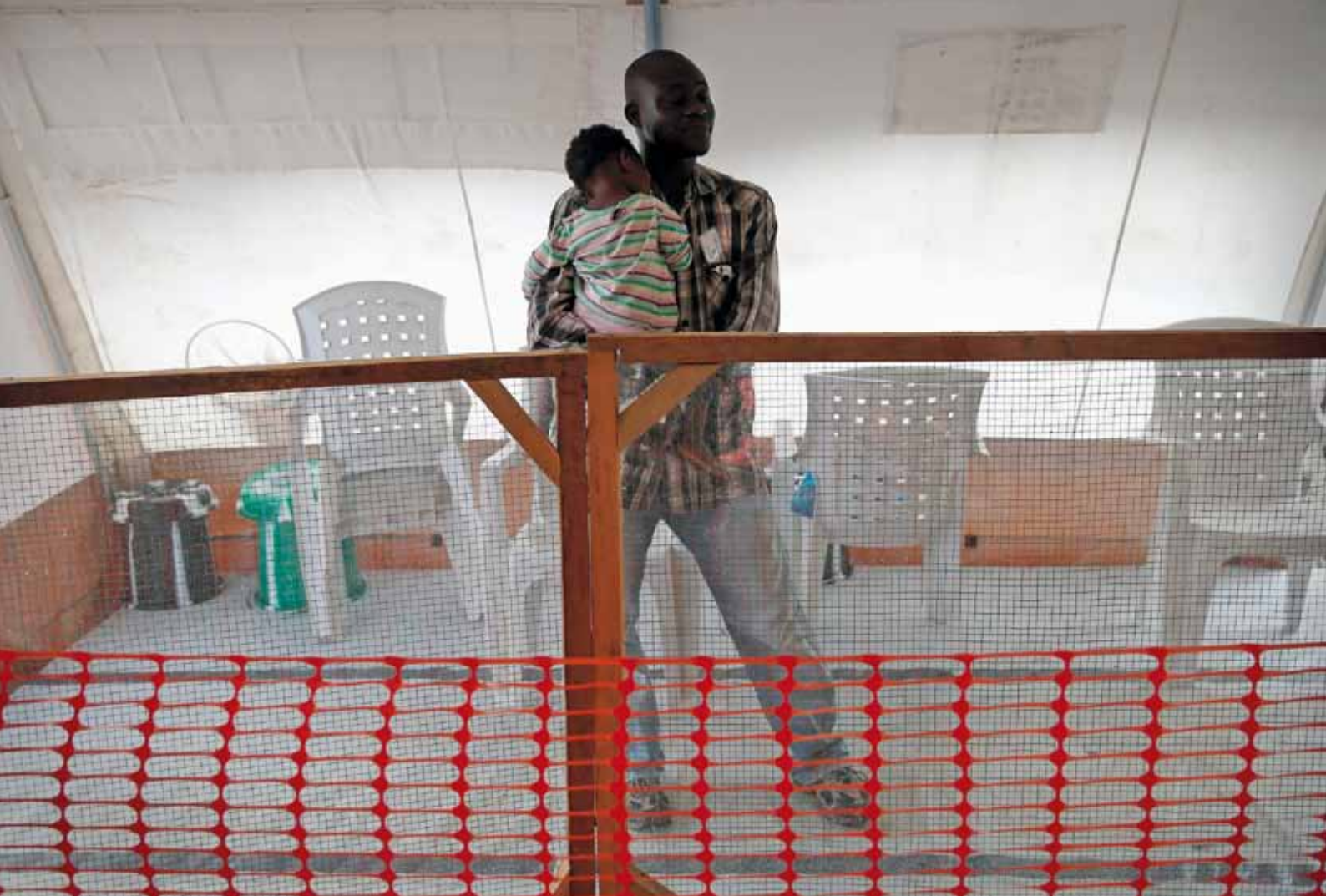
An Ebola survivor holds his sick daughter while waiting at the triage in MSFs ETC in Paynesville