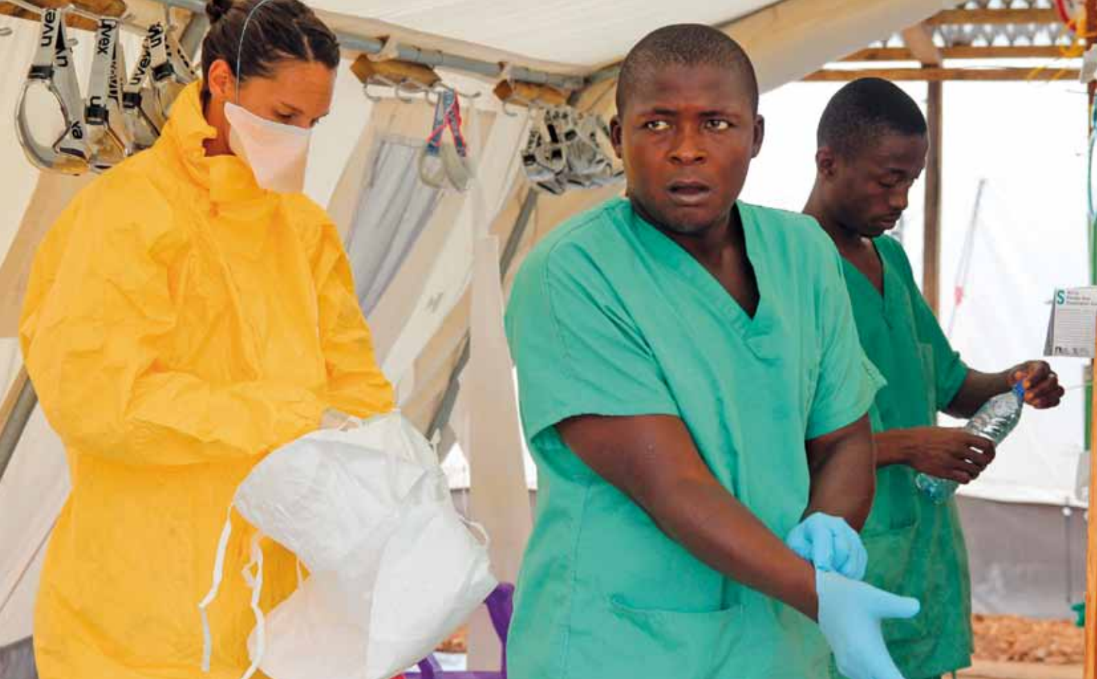
Two MSF staff dress in protective equipment before entering the high-risk area of the ETC in Kailahun