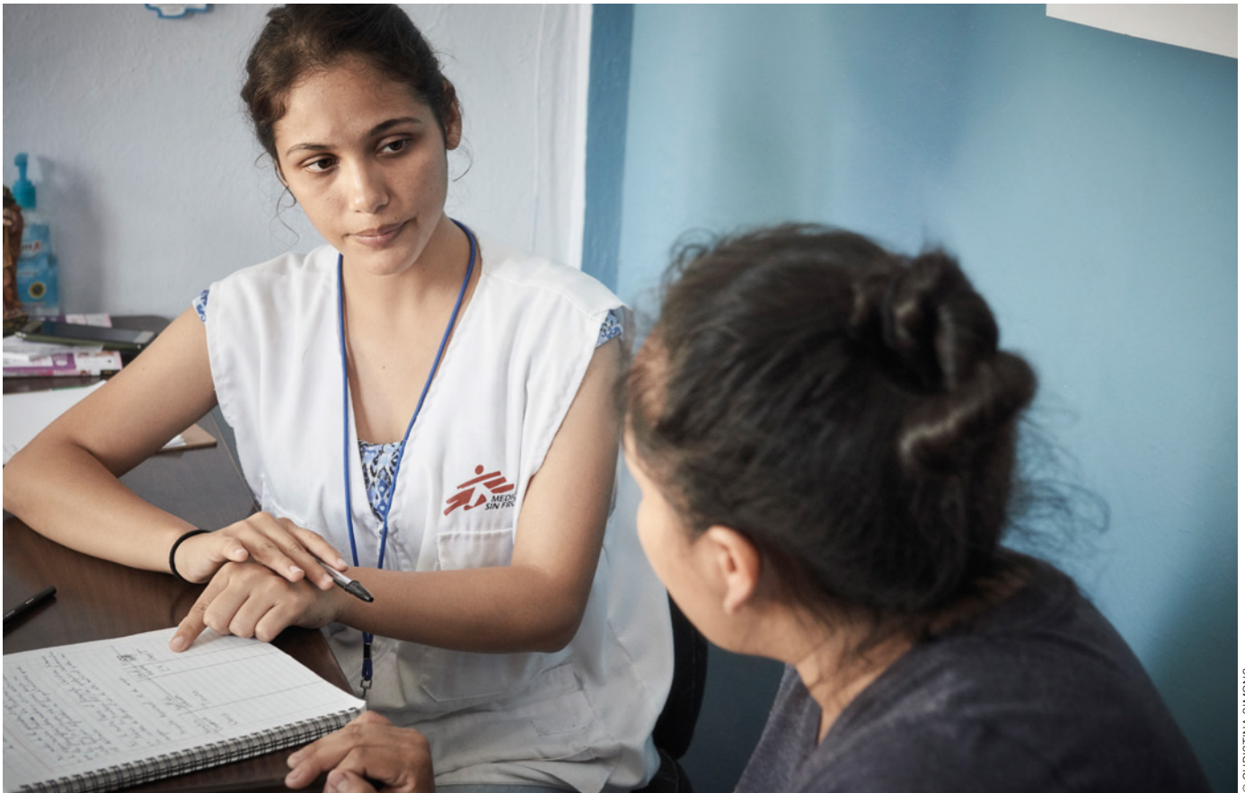
Consultation in Reynosa, Tamaulipas, Mexico.