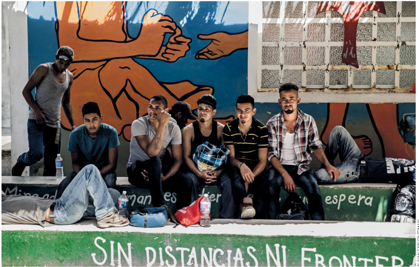
Migrants and refugees wait to register at La 72 shelter in Tenosique, Tabasco, Mexico.